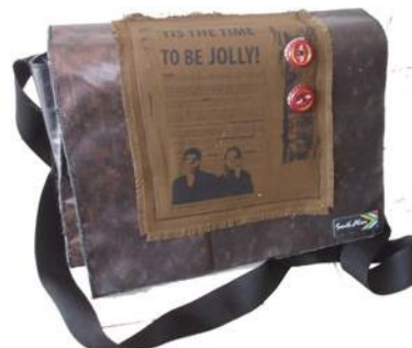
Cool hardcore recycle bag £10.66