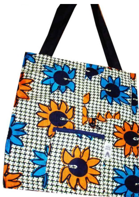
Happy Pants bag £7.55

Sold at the cost price to ICAN (no profit-making), your choices are: